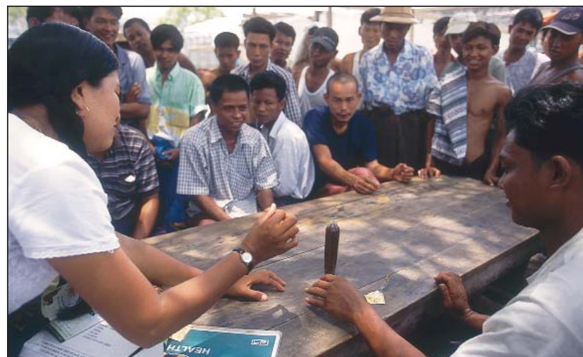
Rubber meets road. An educator with Population Services International raises the condom consciousness of truck drivers.

Mandalay does have a fairly progressive condom education and distribution program.