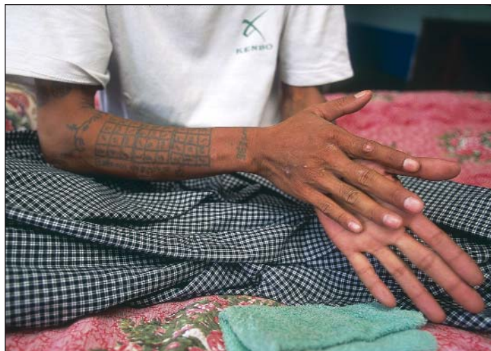
Hand in hand. Heroin injection and HIV infection unfortunately have afflicted many gem miners, such as this man.